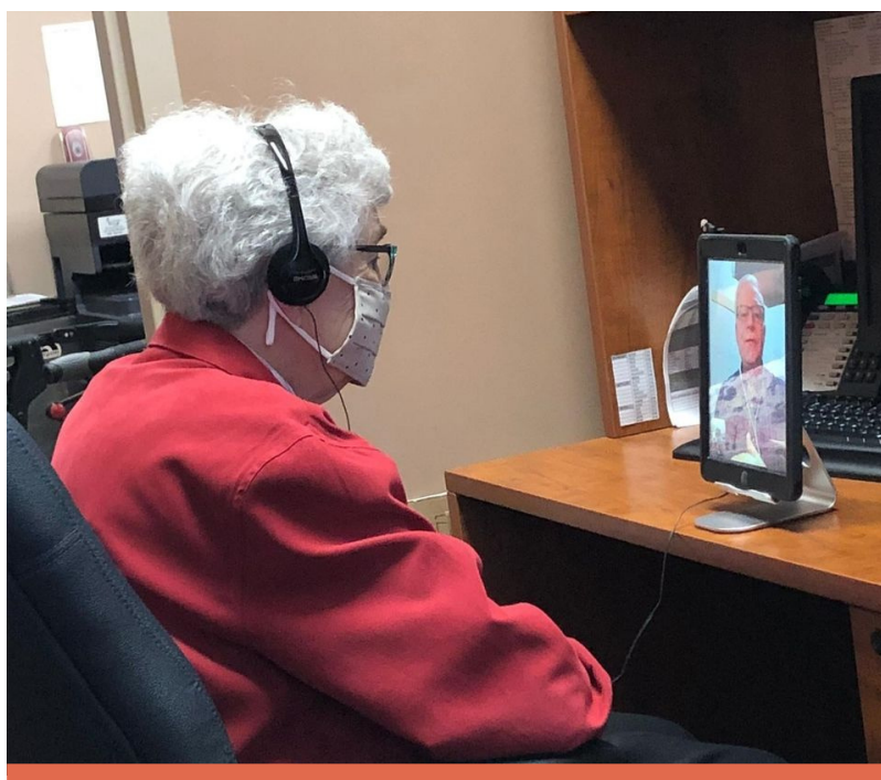
A senior at The Elliott Community connecting with a loved one through an iPad made possible through United Way COVID funding

We are incredibly proud and inspired by all of the agency partners who showed tremendous compassion and adaptability to ensure there was a strong foundation of services available for the people who needed them. Our long history of partnership helped prepare us for the challenges we faced in 2020, but also allowed us to form new partnerships that will benefit our community in the long-term. To each and every organization who did everything they could when our community needed them most -thank you.