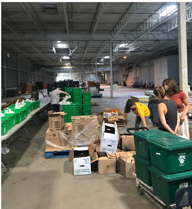
Volunteers packing groceries for the Emergency Food Home Delivery program at The Seed Warehouse

Many of the projects that were funded during the pandemic are not short-term solutions, but the keys to making social services more integrated and inclusive moving forward. If sustainable, many programs will act as the catalyst for lasting positive change in our community.